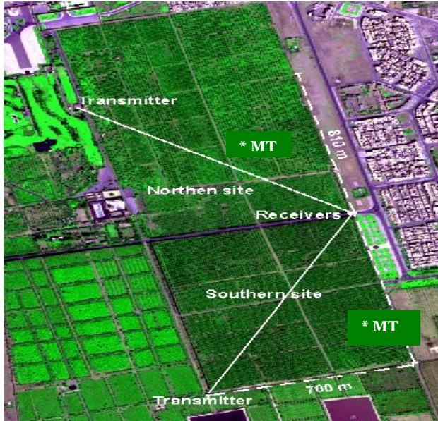
Fig. 1: Overview of the location site and the experimental setup, locations of LAS and micrometeorological towers (MT) are marked

The present study was carried out in the fall of 2002, between Day of Year (DOY) 294 and 308 at the 275 ha Agdal olive orchard, located southeastern of the Marrakech city, Morocco (31°36' N, 07°58' W) (Figure 1). In this section, only a brief summary of site description and experimental setup are provided, the reader is referred to [6], for a complete description. The experimental area is divided in two fields, which are referred to as the southern site and the northern site (see Figure 1).